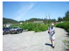
Coordinates of parking areas were located with GPS units