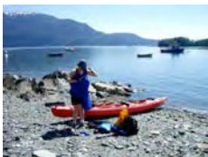
GPS coordinates and photos of the island were obtained from a kayak

Starting from Smuggler's Cove via kayak, data was gathered by taking GPS waypoints around the perimeter of Spuhn Island and returning to Auke Bay harbor. We also marked the parking lots with GPS coordinates to fix their locations on CBJ plat maps. In addition, we interviewed the harbormaster, reviewed the Spuhn Island website for number of lots to be sold, reviewed data from the CBJ assessor's office, and captured digital photographs of the Spuhn Island area and Auke Bay harbor. ArcGIS was used to create an ArcMap document outlining the entire study area on a satellite image.